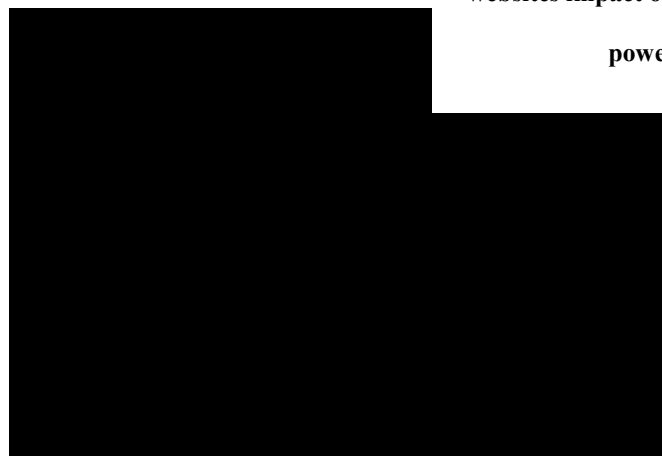
Figure 3: The level of internet websites impact on student-lecturer referent power relationship

Initial results show that the use of web pages for the purpose of study is very low among students of both genders as shown in figure (1). More than 60% of students use websites only for 1-5 hours and less per month. However, this low amount of the use has noticeable impacted on their association with their lecturers as shown in figure (3) where