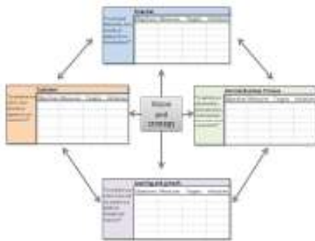
1996 BSC model by Norton and Kaplan

The balanced scorecard (BSC) is a special tool that is designed for managing strategy performance. This strategy is widely being used by managers for keeping a track of the activities carried out by the staff. The characteristic of the balanced scorecard is the arrangement of a combination of financial and non-financial processes which is used for evaluating to an intended value within a particular concise statement. The final statement which is produced with balanced scorecard (BSC) is not considered to be a substitute as compared to the conventional financial reports (tandfonline, 2012).